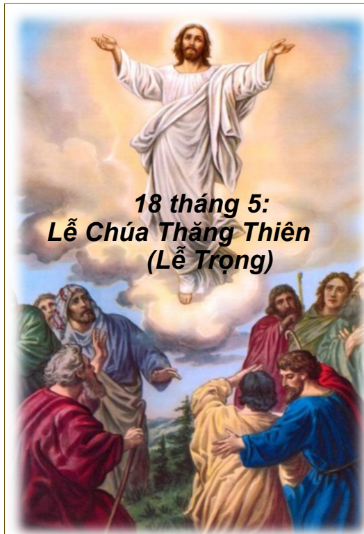
18 tháng 5: Lễ Chúa Thăng Thiên (Lễ Trọng)