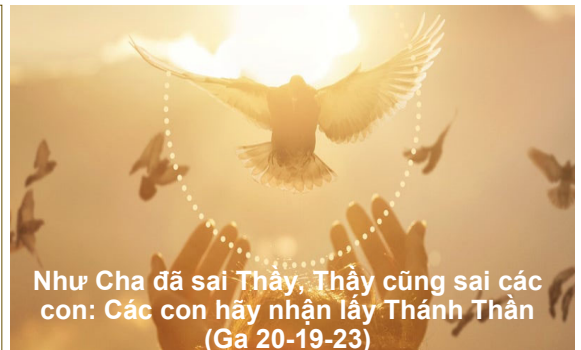
Như Cha đã sai Thầy, Thầy cũng sai các con: Các con hãy nhận lấy Thánh Thần (Ga 20-19-23)

là một ngày lễ được cử hành sau Lễ Phục Sinh bốn mươi ngày (tính từ Chúa Nhật Phục Sinh). Do đó, lễ này luôn rơi vào một ngày Thứ Năm, nhưng thường mừng kính trọng thể vào ngày Chủ Nhật của tuần đó. Lễ Thăng Thiên diễn tiến theo ý nghĩa nội dung Tân Ước, theo đó, sau khi Chúa Giêsu sống lại, Ngài đã ở lại cùng với các môn đồ trong bốn mươi ngày, sau đó lên Trời để kết thúc sự hiện diện của Ngài giữa loài người trần thế.