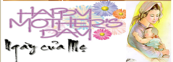
Chúc Mừng Ngày Hiền Mẫu đến các bà Mẹ.