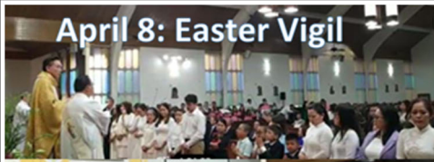
April 8: Easter Vigil