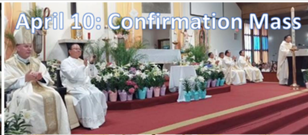
April 10: Confirmation Mass